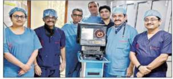
एसजीपीजीआई में नई मशीन के साथ चिकित्सकों की टीम। अमृत विचार